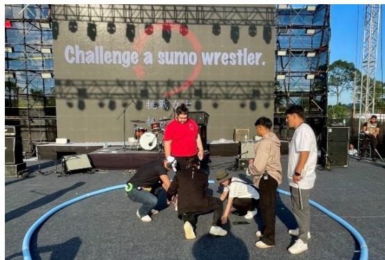
A sumo ring set up on the stage