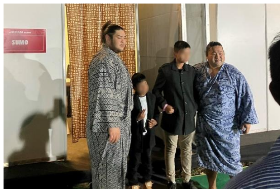
Interaction with the audience