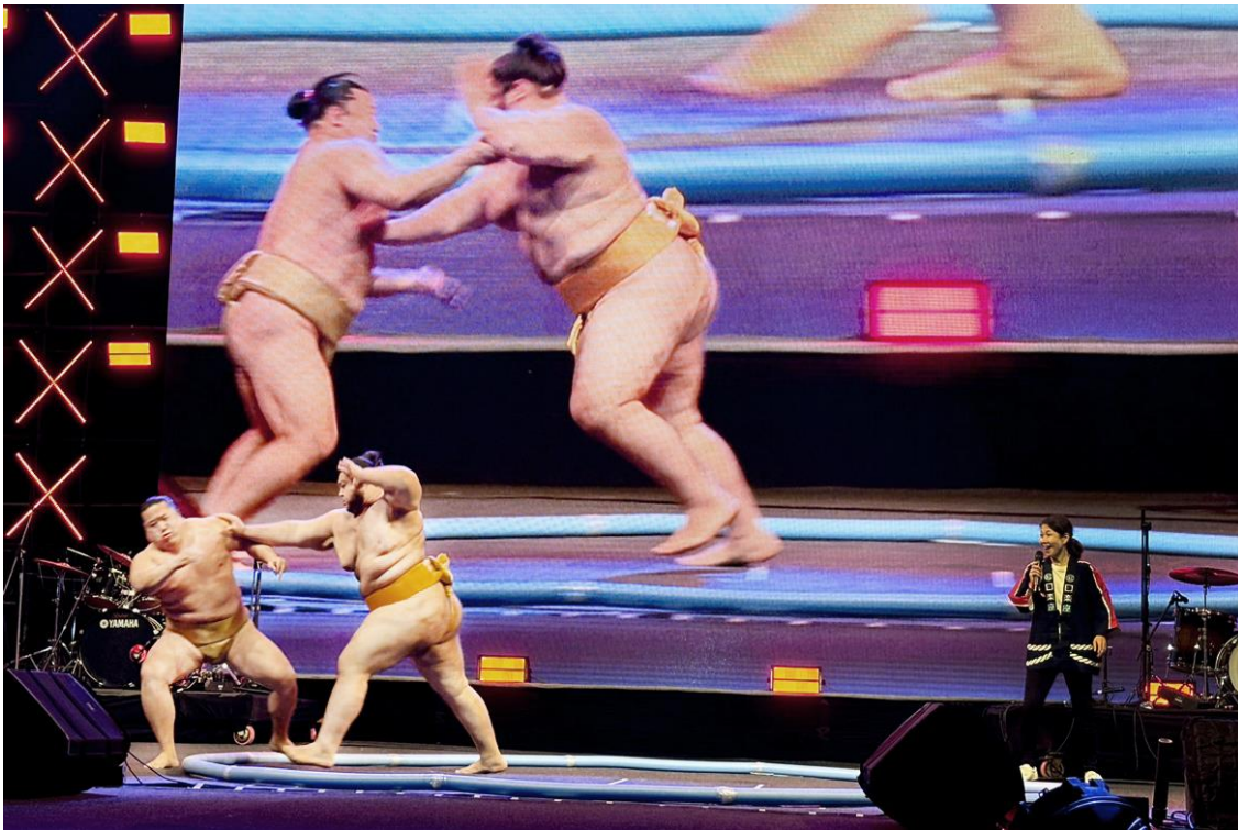
Dynamic matches on the dohyo stage (sumo ring)

Hanshin Contents Link Co., Ltd., the operator of the inbound-focused sumo entertainment venue “THE SUMO HALL HIRAKUZA OSAKA,” achieved a remarkable milestone with its first-ever overseas performance on November 15 and 16, 2024. The performance was held at the Cherry Blossom Festival in Meghalaya, India, where approximately 500 attendees experienced the unique charm of Japan’s culture through one of its national sports, sumo wrestling.