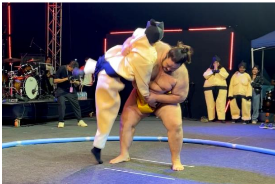
Sumo challenge. Wrestlers vs Spectators