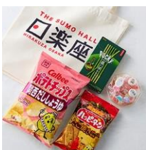
HIRAKUZA Snack Bag