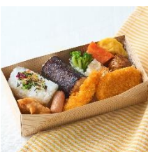
HIRAKUZA Child Bento